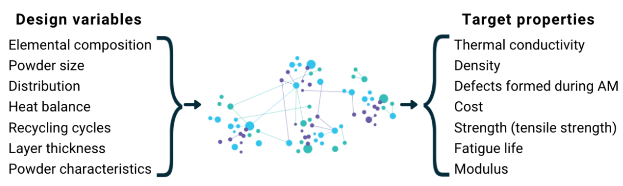
Figure 3. Subset of input parameters and target properties used to generate the Alchemite<sup>™</sup> model

Intellegens used its Alchemite<sup>™</sup> deep learning methods to work in close collaboration with GKN Aerospace in order to analyse all titanium alloy data available from them. Twenty physical properties were considered for 256 historical alloys to generate a machine learning model of the properties of interest (refer to Figure 3 for a subset of design variables and target properties). The high quality model delivered a cross-validation R of 0.8.